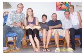
Marriage conference group.