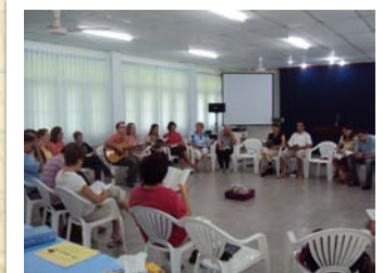
Leading worship at the language conference.