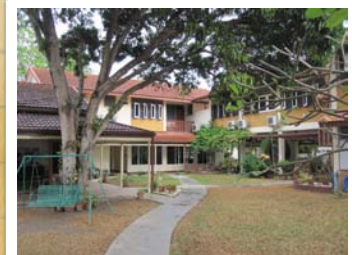
Guesthouse in Prajuab.