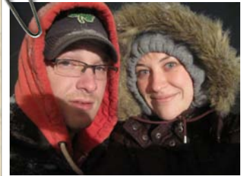
All bundled up after a real snowball fight!

Now that we're back to Bangkok, the process of finally getting back into the swing of "normal life" has begun once again. We're looking forward to picking up where we left off, and are greatly encouraged by how much we actually missed our life here and being "at home" in this city.